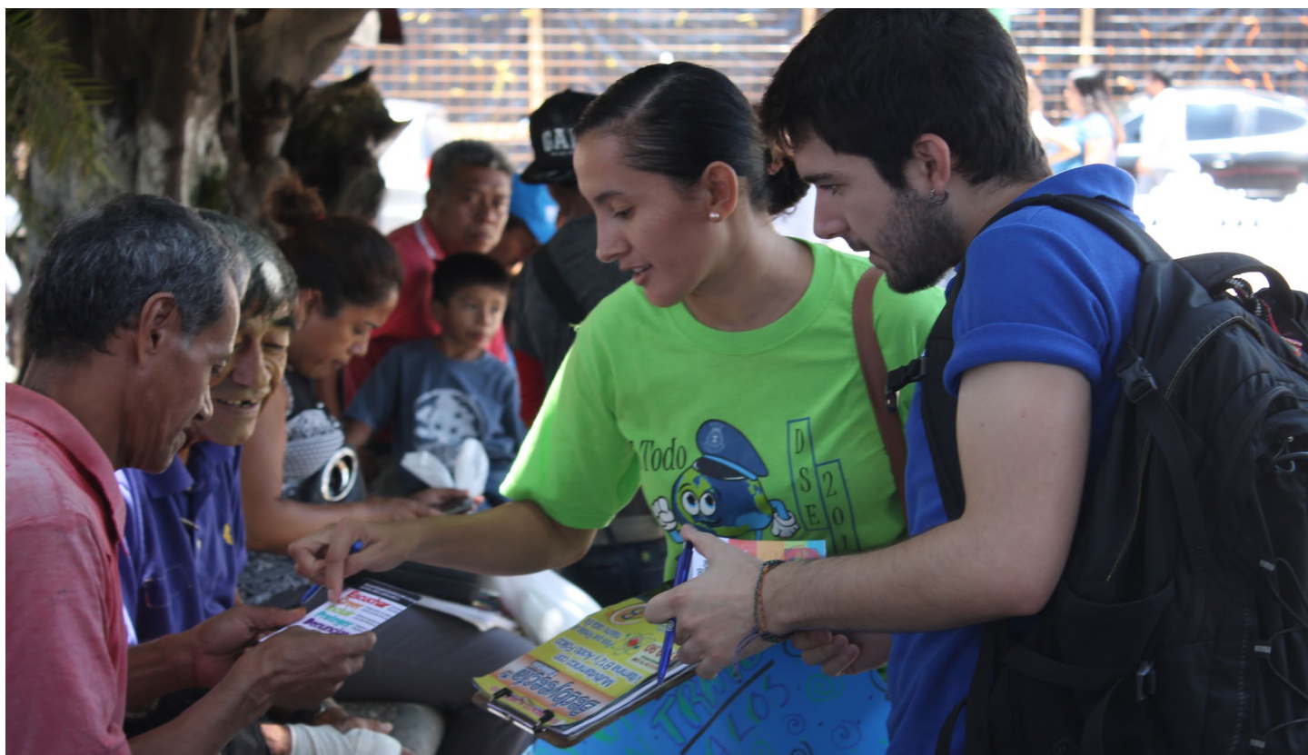
Mobile hubs.

The Migration Information Centers or Information Hubs are a model developed at the global level that has been adapted to each country or region, and the target population. The nature, functions, services offered, and audiences assisted by the information centers in the region vary according to the local context. There are many variations in regard to facilities and administration, but the following three commonalities set an understanding of the hub's role in the region: