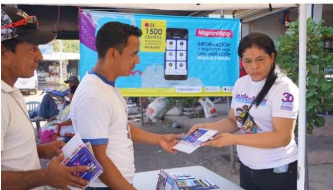
Information Hubs inform communities about migration, providing persons with tools for regular migration such as the MigrantApp. Chinandega, Nicaragua.

reached through mobile information activities.